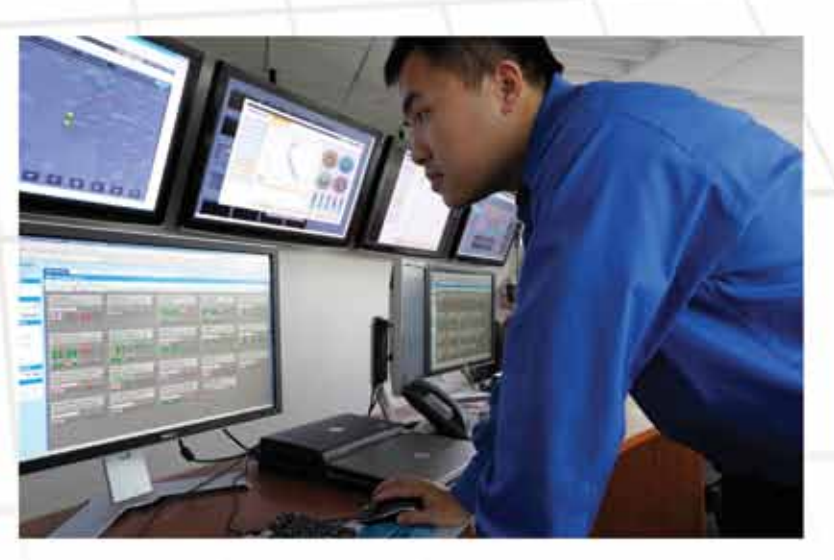
Weatherford integrates multiple data streams with expert interpretation to maximize drilling efficiency at WellHub centers such as this one in Canada.

Multistation analysis (MSA). MSA combines data from multiple survey shots to calculate any residual magnetic interference from the bottomhole assembly (BHA). This calculation can be applied as a QC process to ensure that survey data are not being corrupted by magnetic interference. Or, it can be applied as a correction to downhole data to improve the quality of survey results.