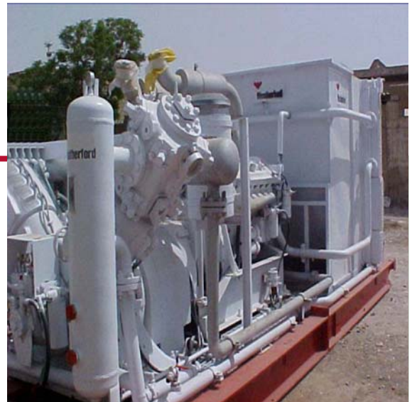
Weatherford MENA Air-Drilling Operations Number of Wells Drilled