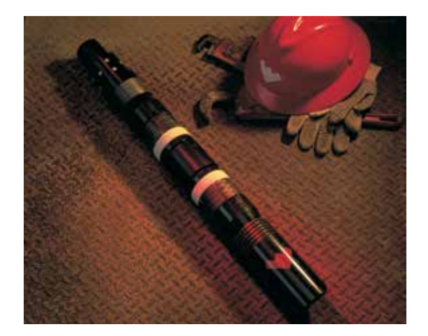
Weatherford's FracGuard® plug can be installed using coiled-tubing conveyance.

Weatherford production services maximize reservoir recovery and field production through our wide array of services, including artificial lift, production chemicals, production optimization, flow assurance and remedial services.