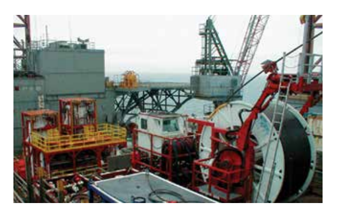
Offshore coiled-tubing equipment meets small footprint requirements.

Thru-tubing fishing and milling services include fish removal, underreaming, tubing cutting, window milling and drilling. We also provide thru-tubing casing exits and thru-tubing packers.