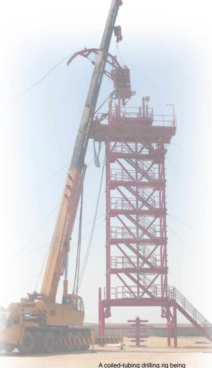
A coiled-tubing drilling rig being constructed in Algeria.