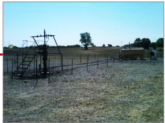
Weatherford installed its low low-volume PL-III pump at 6,800 ft (1829 m) with a 41° inclination.