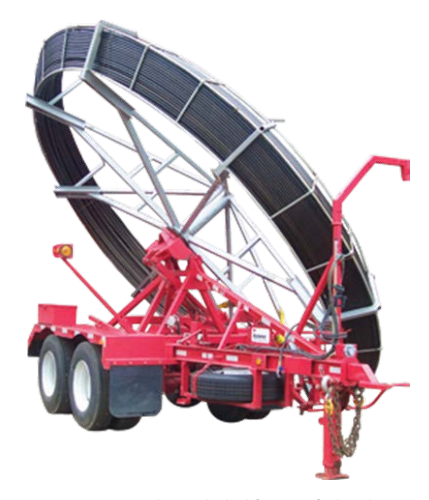
COROD continuous rod extends the life span of tubing by eliminating localized contact loads caused by couplings. Installation is quick, and Weatherford offers a full array of field servicing options.

COROD continuous rod provides a superior alternative to conventional sucker rods. Unlike conventional sucker rods, which are coupled every 25 or 30 ft (7.6 or 9.1 m), COROD continuous rod requires couplings only at the top and bottom of the rod string, regardless of well depth. This innovative solution reduces pin and coupling failures by decreasing the number of threaded connections, thereby minimizing the potential for rod string failures and costly well interventions. Uniform contact loads and a lighter weight reduce motor power requirements.