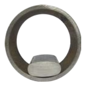
Semi-elliptical COROD continuous rod