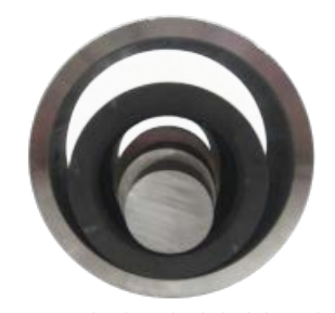
Conventional sucker rod with slim-hole coupling