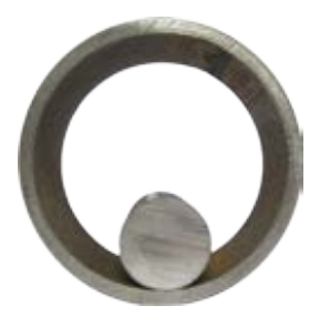
Round COROD continuous rod