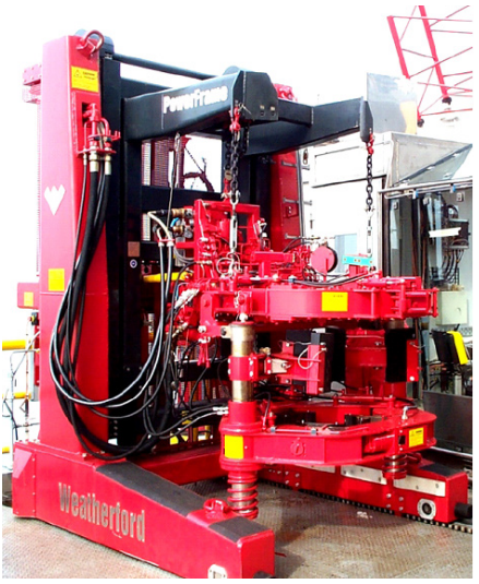
24-50 high-torque casing tong installed in the PowerFrame system