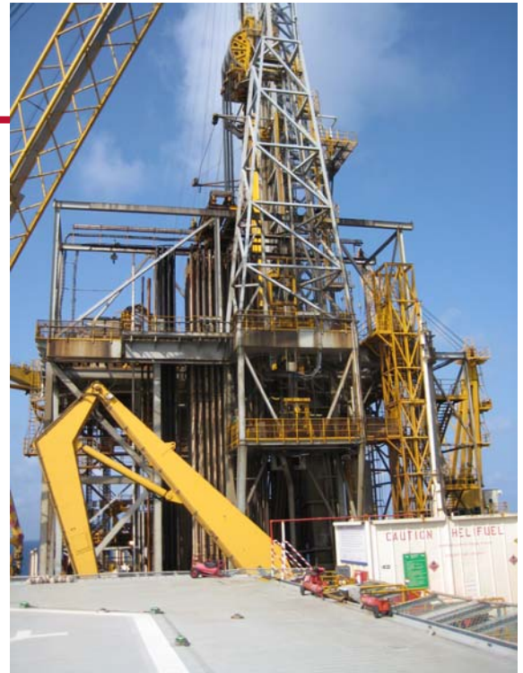
Two oil-producer ESS completions were deployed from this semi-submersible rig.