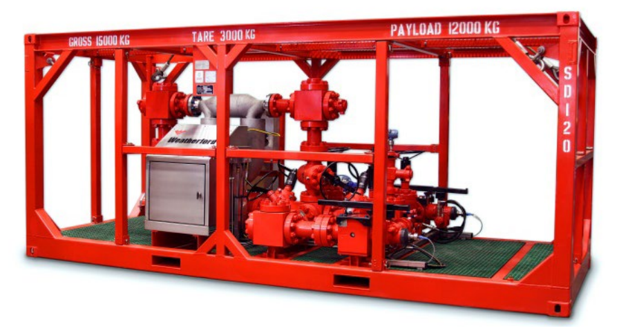
The MPD system detects minute fluid influxes or losses with a degree of precision that is unattainable using conventional drilling methods.

Managed Pressure Drilling Averts Well-Control Incident, Circulates Influx Out in 4 Hours, Enables Operator To Achieve TD in Montney Formation