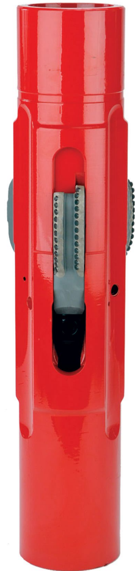
The Weatherford RipTide ball-drop drilling reamer 12000 has retractable and concentric cutter blocks that minimize vibration while drilling and facilitate tool retrieval.

The reamer is hydraulically activated using the proven Weatherford mechanical ball-drop system. After the ball is seated, pumps are turned on to increase standpipe pressure. Precise flow rates shear locking pins and permit the cutter blocks to extend fully from the reamer body. When pumps are turned off, the cutter blocks retract into the body.