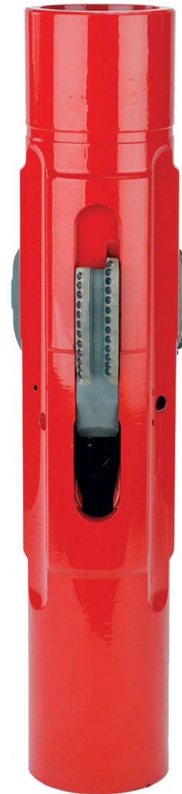
The Weatherford RipTide ball-drop drilling reamer 14750 has retractable and concentric cutter blocks that minimize vibration while drilling and facilitate tool retrieval.

The reamer is hydraulically activated using the proven Weatherford mechanical ball-drop system. After the ball is seated, pumps are turned on to increase standpipe pressure. Precise flow rates shear locking pins and permit the cutter blocks to extend fully from the reamer body. When pumps are turned off, the cutter blocks retract into the body.