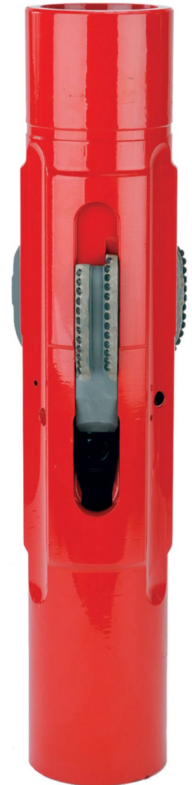
The Weatherford RipTide RFID drilling reamer 6000 has retractable and concentric cutter blocks that minimize vibration while drilling and facilitate tool retrieval.

The reamer is electronically activated using RFID technology, which provides virtually unlimited activations and deactivations on demand. A small yet durable RFID tag is dropped into the drillpipe ID at surface level and carried downhole in the drilling fluid. The tag transmits instructions to the electronic downhole reader on the reamer controller. Then the controller unlocks, which allows the cutter blocks to fully extend from the reamer body. Alternatively, the reamer controller is equipped with a second method of activation via pressure cycling. At any point in the operation either method of activation can be used.