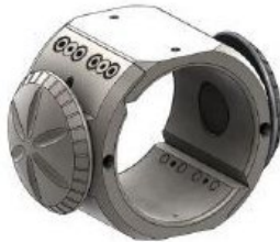
5-1/8" Max Lift