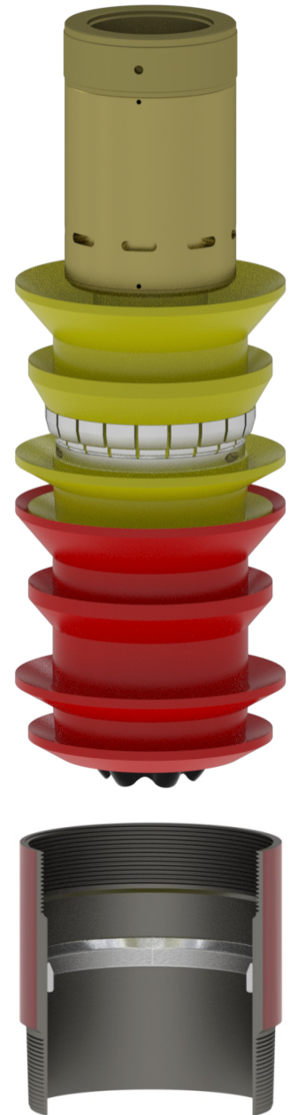
The subsurface-release plugs (above) pass through the locator collar (below) and produce an indication that is observable at the surface.

The system meets the temperature and pressure ratings of Weatherford plugs equipped with polyurethane fins and Duromer™ cores.