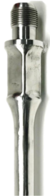
Weatherford EX stainless-steel sucker rods provide superior strength and long-lasting durability in corrosive environments.