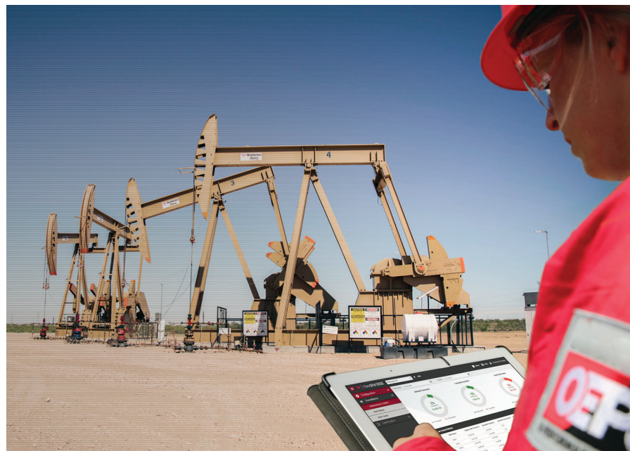
Fig. 1. A field engineer analyzing production data at a Permian basin location.

For example, if a formation begins releasing extra fluids into a wellbore, this influx would automatically trigger the